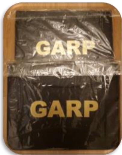
Image showing structures in twin chamber 2024 (below), Research data packages delivered 21 st October 2022 (left)